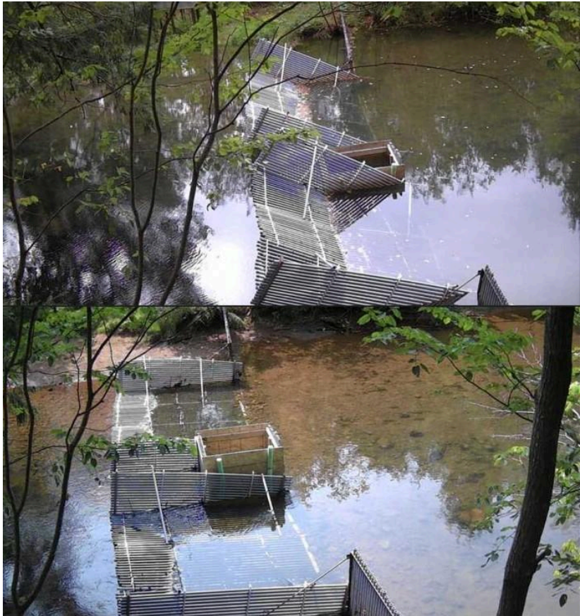
Figure 3. A top down view of the Riverwatcher project location on a high and low tide