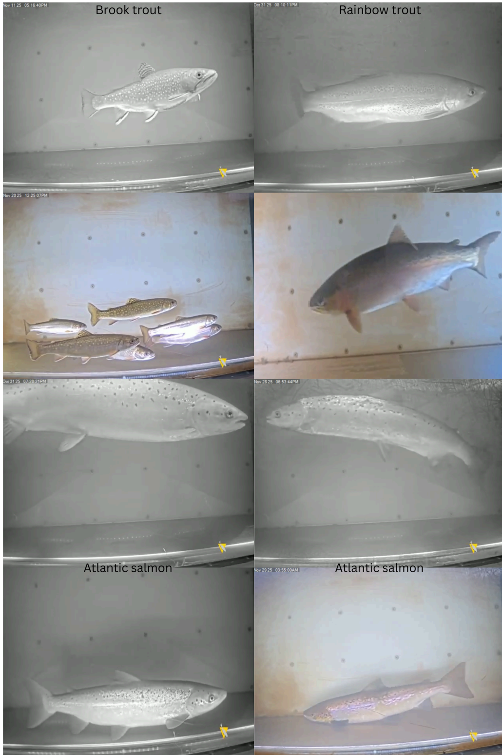
Figure 4. Pictures of observed species travelling through the camera tunnel