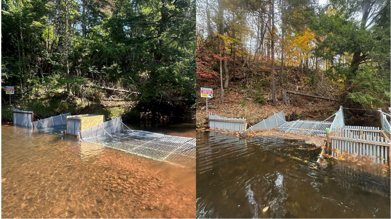
Figure 2. Pictures of the Riverwatcher and fish fence setup and location